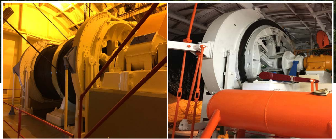
Infrastructure at Site – Well Maintained

* Reserves or Proven and Probable tons are SEC Compliant but are not to be considered 43-101 Compliant