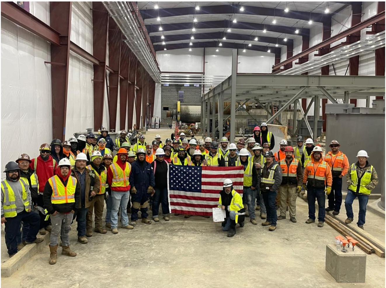
Figure 1 - Bunker Hill Staff and Contractors standing inside the 1800tpd processing plant in Kellogg, Idaho